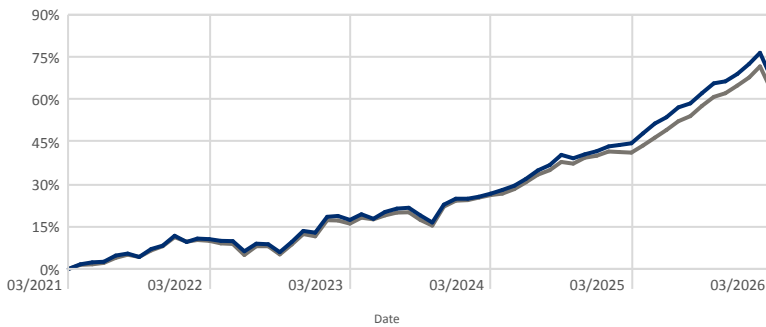
— Sage BCI Moderate Solution Fund of Funds (B4) — Fund Benchmark