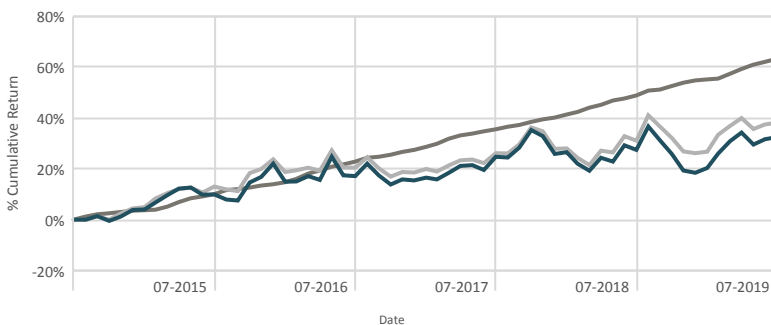
— BCI Worldwide Flexible Fund of Funds (3B1) — ASISA Category Average — Fund Benchmark